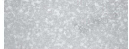
ORANGE PEEL TEXTURE